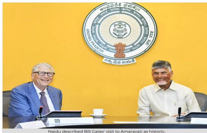
Naidu described Bill Gates' visit to Amaravati as historic.