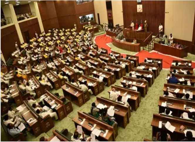
Andhra Pradesh Assembly.

for MLAs to curb persistent absenteeism and ensure meaningful participation in legislative proceedings.