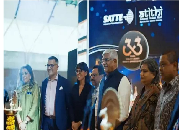
SATTE 2026, South Asia's largest travel and tourism exhibition, will remain open till Friday, February 27.

State's tourism potential and strengthen global tourism partnerships.