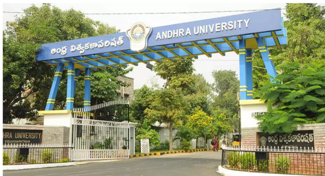
The conference, themed 'Swastha Nari - Sashakt Bharat' (Healthy Woman - Empowered India), is expected to attract over 1,000 participants from across the country, including women Ayurveda experts, practitioners, product manufacturers, Andhra University faculty members and students.

Andhra University is set to host WAPCON-2026 , the first national conference focused exclusively on women in Ayurveda , highlighting women's health, leadership, and entrepreneurship in traditional medicine.