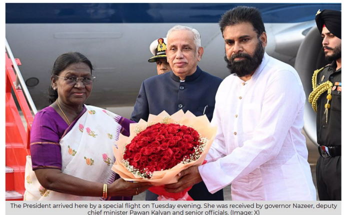
The President arrived here by a special flight on Tuesday evening. She was received by governor Nazeer, deputy chief minister Pawan Kalyan and senior officials.

gathering showcasing maritime cooperation and naval diplomacy.