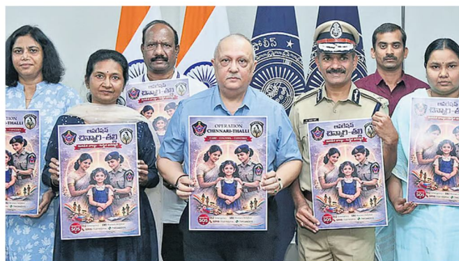
The campaign was inaugurated with the release of a poster at the DGP's office in Mangalagiri on Thursday.

Operation Chinnari-Thalli is a special initiative launched by the Andhra Pradesh Police under the Women and Child Safety Wing. The programme aims to prevent crimes against children and create a safe environment for minors. The initiative carries the tagline “Safe childhood for sustainable development.”