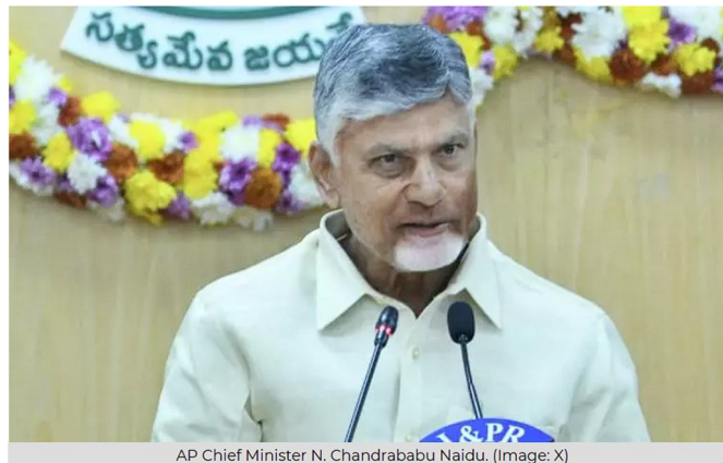
AP Chief Minister N. Chandrababu Naidu.