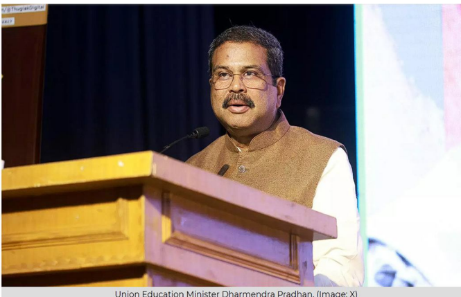
Union Education Minister Dharmendra Pradhan.