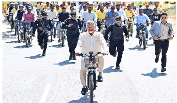
Chief Minister N. Chandrababu Naidu leads an e-cycle rally in Kuppam as part of the record-setting distribution of 5,555 electric cycles promoting green mobility and sustainable transport.

single day , under the “Green & Healthy Kuppam” initiative, led by Chief Minister N. Chandrababu Naidu, showcasing a large-scale, people-centric model of green mobility and sustainable transport .