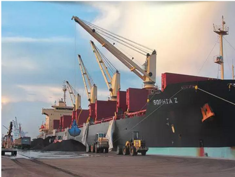
The Ministry of Ports, Shipping and Waterways said that four major ports - Mulapeta port, which is formerly Bhavanapadu port in Srikakulam district, Machilipatnam port in Krishna district, Ramayapatnam port in SPSR Nellore district and Kakinada SEZ port were under construction in Andhra Pradesh. (File Photo)

These projects aim to enhance cargo handling capacity and support industrial growth along the eastern coastline.